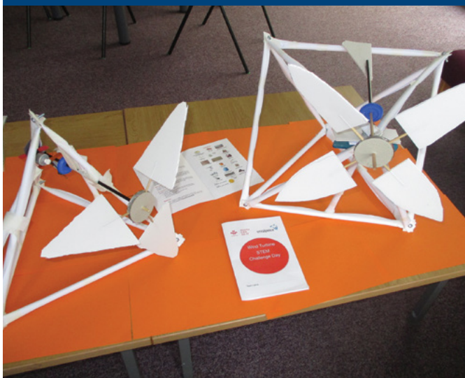
A STEM project with North Yorkshire Business and Education Partnership (NYBEP) to build a working wind turbine