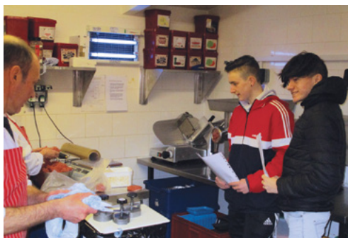
Working in the Cookery cabin at Pickering Junior School and a visit to Cranswick Foods, Norton as part of BTEC Home Cooking

We work on supporting issues raised by the referring school and parents to ensure a student becomes motivated, engaged and resilient learner.