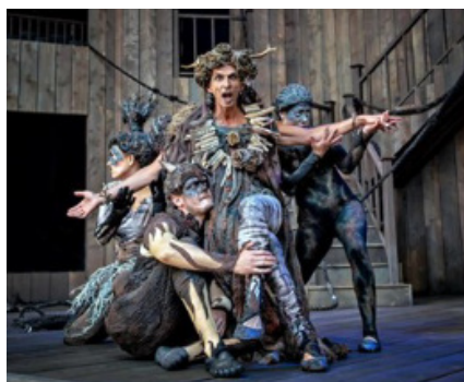
Visits to the Rose Theatre in York to see A Midsummer Night's Dream (July 2018) and Twelfth Night (July 2019)