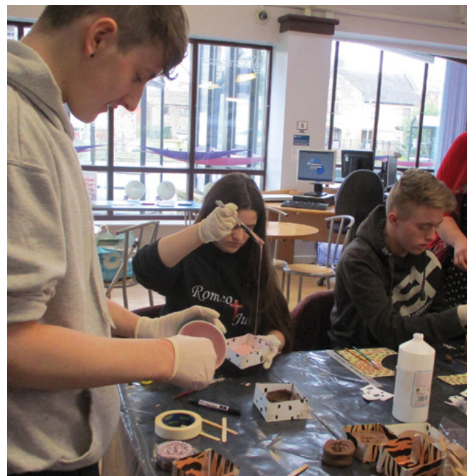
A community art project with Pickering Library working with an artist in residence